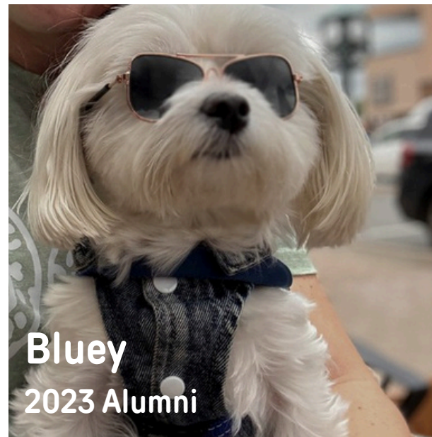
Bluey 2023 Alumni