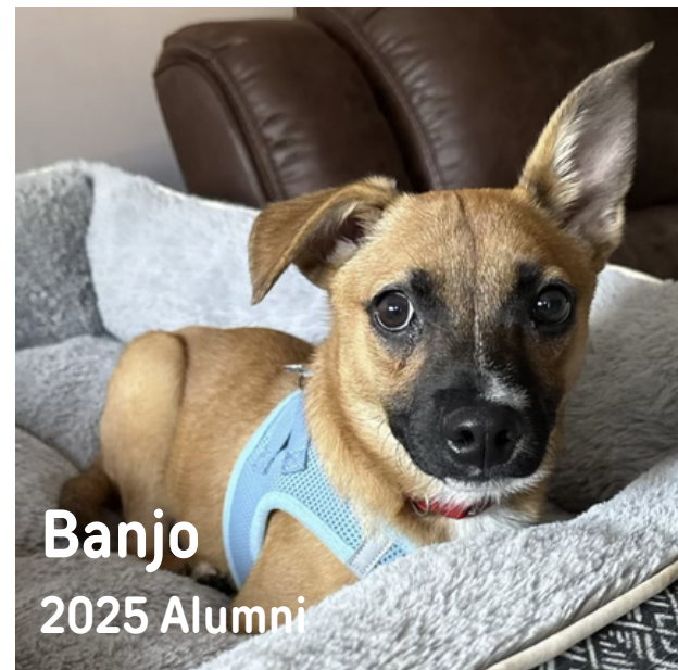
Banjo 2025 Alumni