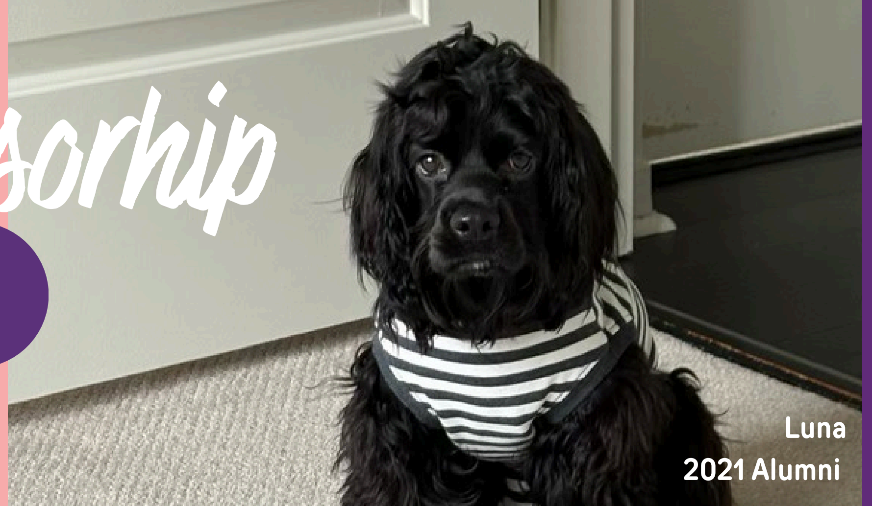
Luna 2021 Alumni

A high-visibility partnership with strong on-site presence and integrated brand moments within key attendee experiences. Customize your presence in a way that feels authentic to your brand or organization!