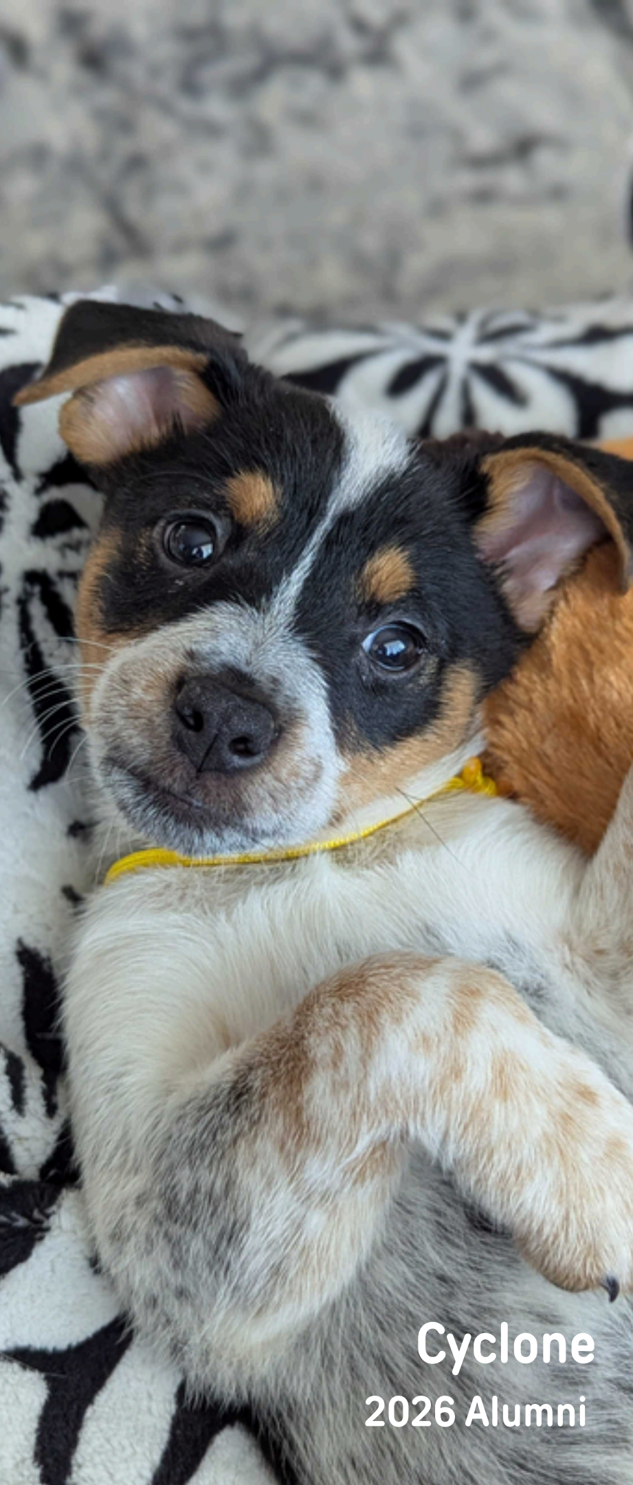
Cyclone 2026 Alumni