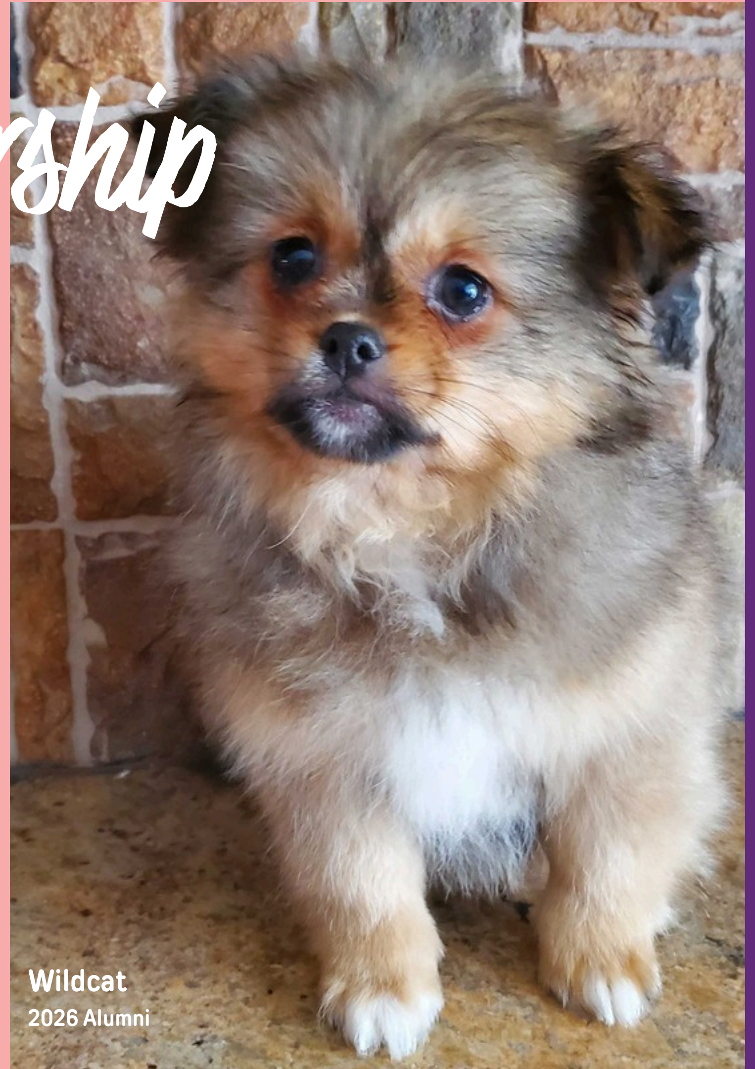
Wildcat 2026 Alumni