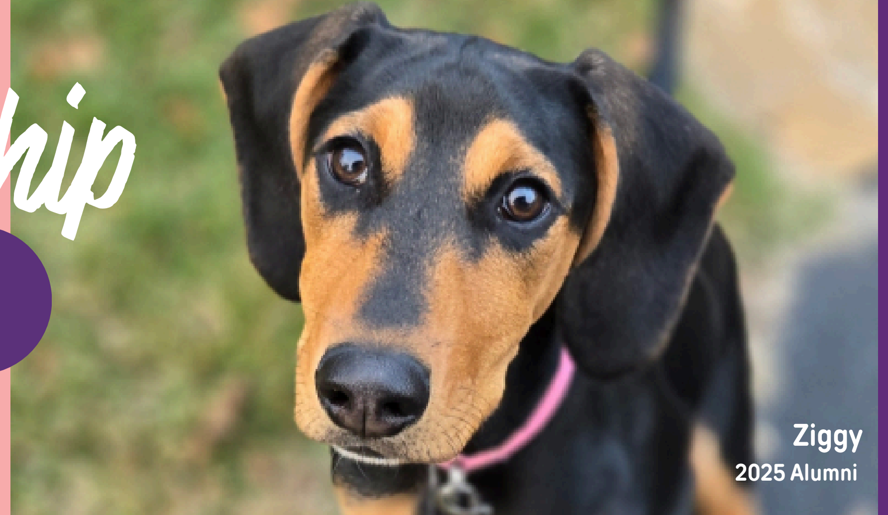
Ziggy 2025 Alumni

Our exclusive presenting partner will have premium visibility across all aspects of the event and make Barknic possible! This tier offers dominant brand presence, high-impact placement, and direct audience engagement surrounding Barknic