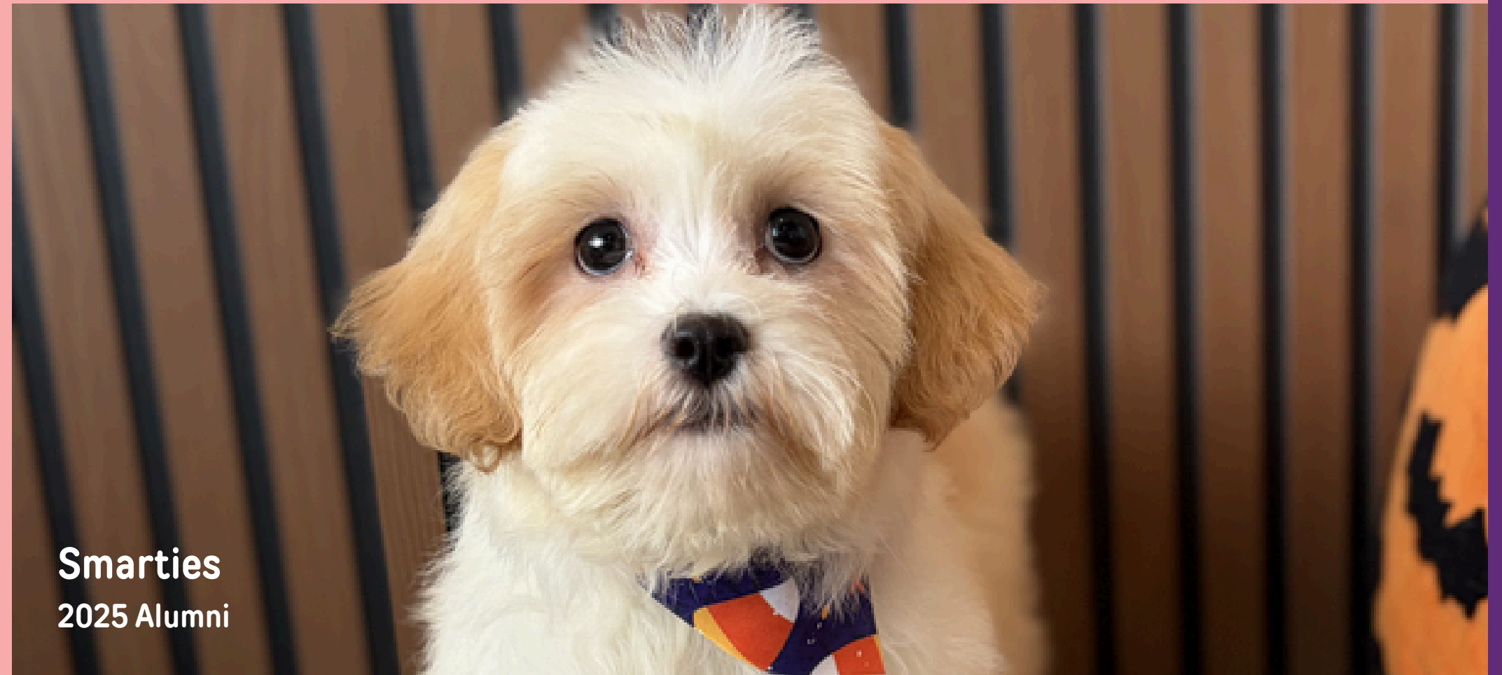
Smarties 2025 Alumni

Each partner receives a curated set of benefits across on-site presence, pre-event promotion, and post-event visibility.