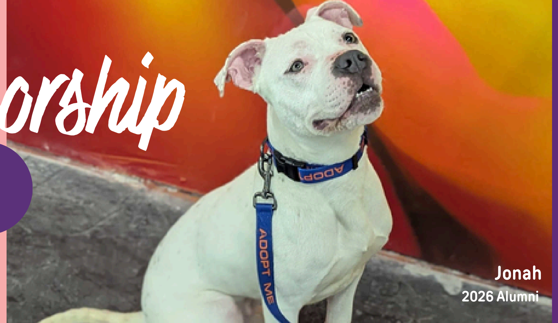
Jonah 2026 Alumni

A high-visibility partnership with strong on-site presence and integrated brand moments within key attendee experiences.