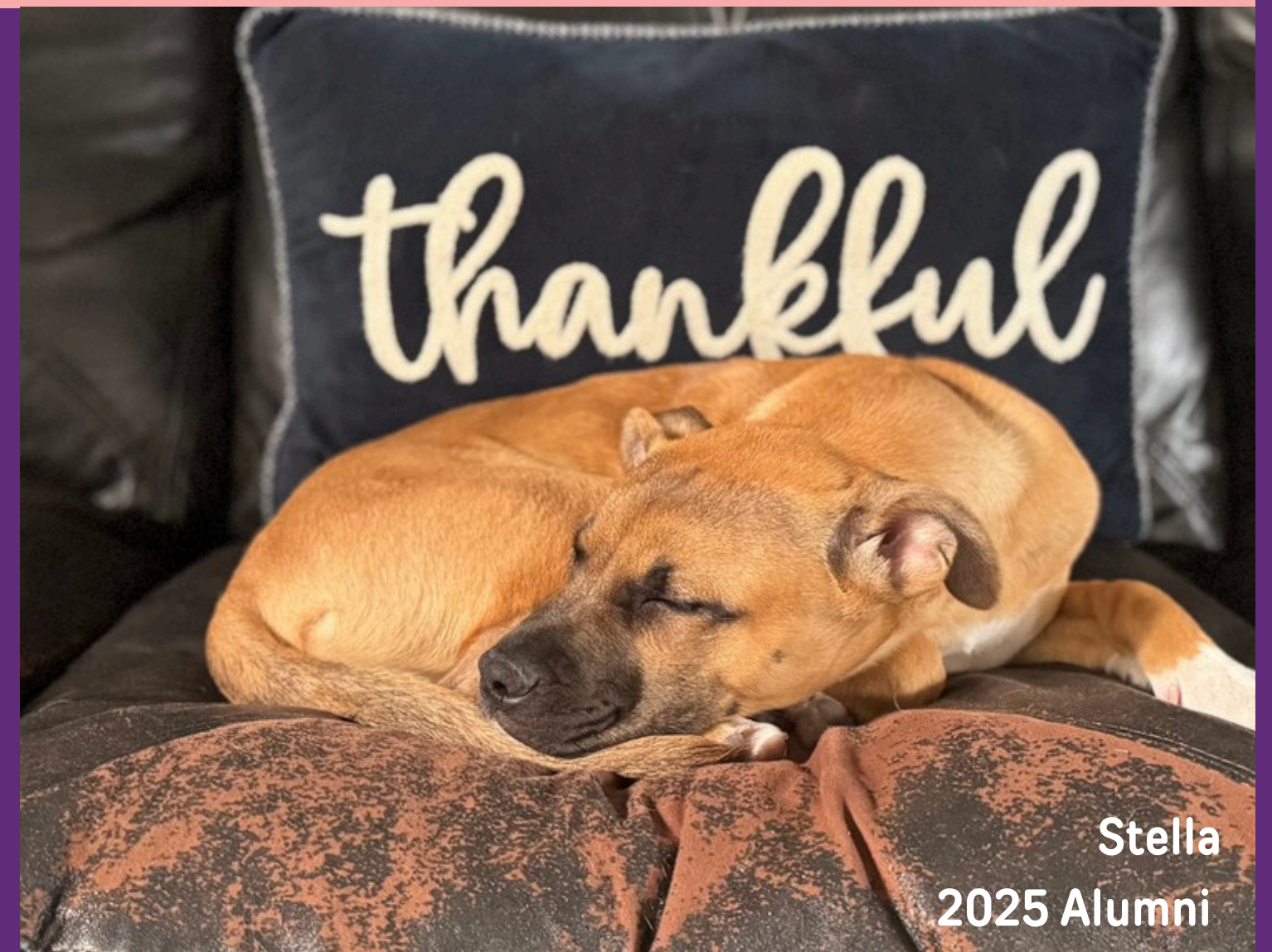
Stella 2025 Alumni